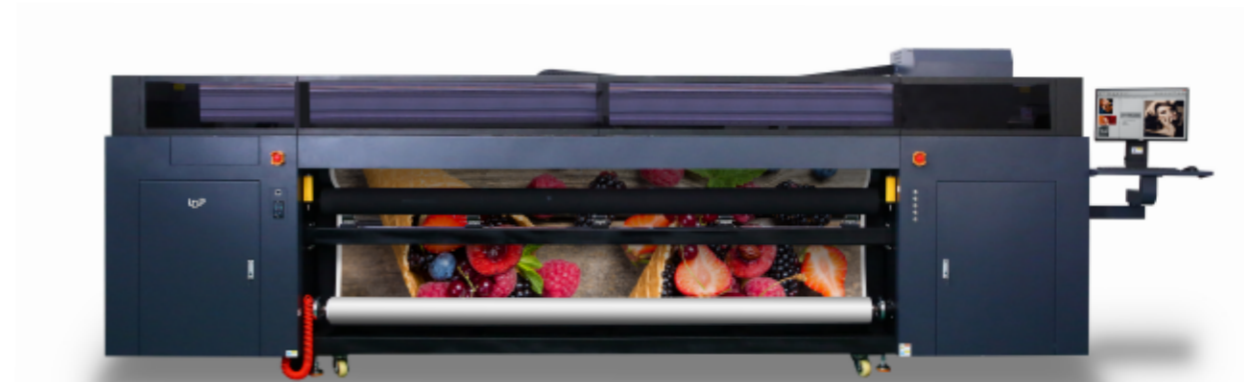
RAPTOR 2 P5 / 5M Tension Roll LED-UV PRINTER