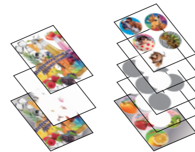
Double-sided effect in one printing

GUV ink offers multi-layer printing modes to create eye-catching images such as double-sided images, perspective effects, and three-dimensional images. With Varnish, print spot glazing and embossing design effects, which are suitable for custom design products, special-effects, and high-profile lightbox ads.