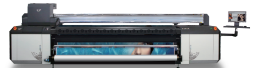
RAPTOR 2 P3 / 3.2M Tension Roll LED-UV PRINTER